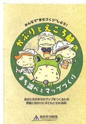
Kaburi and Grandpa Eco Explore and Map Their Community ¥500