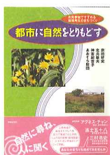
Bringing Nature Back to the City ¥2,000