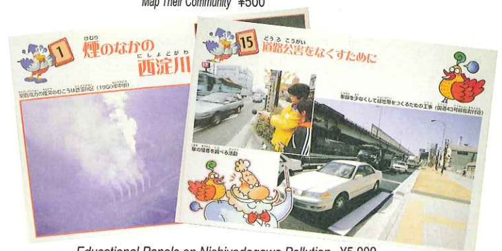
Educational Panels on Nishiyodogawa Pollution , ¥5,000. Sixteen full-color B3 size panels with explanatory documentation.